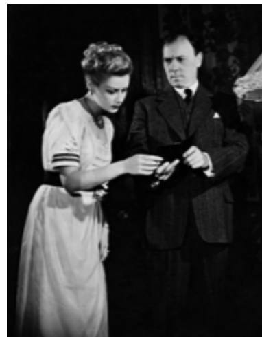
The British Museum

The Inspector's arrival marks a shift in authority from Mr Birling to the Inspector, which can be interpreted as the shift from capitalism to socialism . Mr Birling has, hitherto (until now), dominated the dialogue of the play. His dramatic monologue form of speech excludes the views of others, which is demonstrated by his dismissal of Eric's protest "What about war?" , with "the Germans don't want war" . This reflects how capitalism has dominated society throughout the 19th Century and early 20th Century.